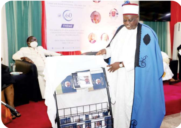
HRH Hon. Justice Sidi Bage, JSC (Rtd.) unveiling the Essays and Tributes

From the J-K Gadzama LLP 14th Public Lecture and Presentation of Essays in Honour of Chief Joe-Kyari Gadzama, SAN 60th Birthday