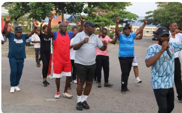
A cross-section of people exercising with Chief Joe-Kyari Gadzama, SAN