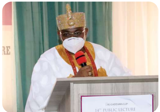
HRH Oba A. O. Aladelusi Odundun II giving a remarks