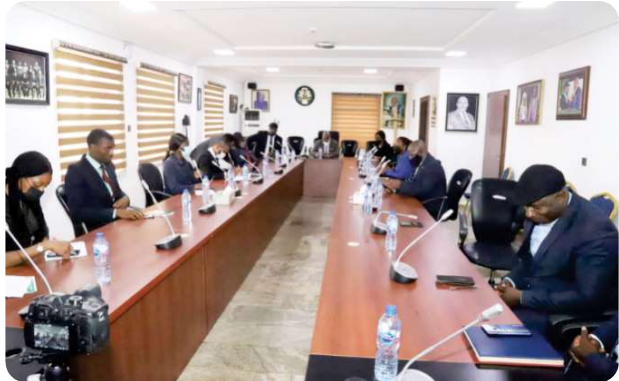
Cross section of Discussants