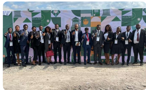
Some Counsel in Chambers of J-K Gadzama LLP during the Annual General Conference of the Nigerian Bar Association