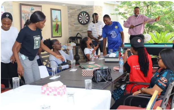
Cross section of some staff of J-K Gadzama LLP