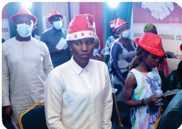
Cross-section of the guests