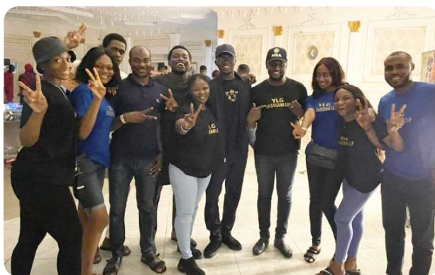
Some members of the Young Lawyers Group of J-K Gadzama LLP during the party