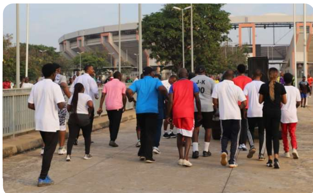
A cross-section of people jogging during the Health Walk with Chief Joe-Kyari Gadzama, SAN