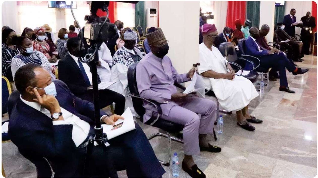
A cross-section of the guests