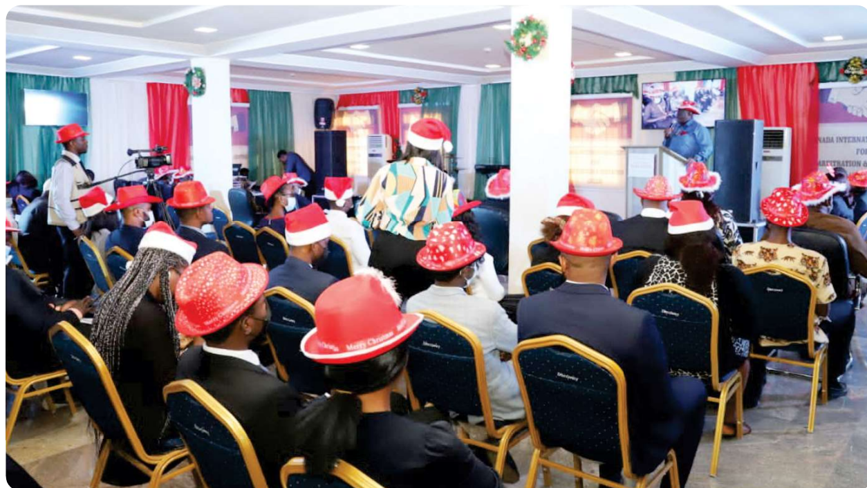
Cross-section of the guests