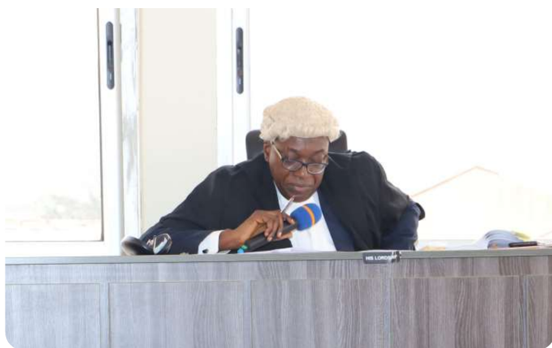
Hon. Justice A. I. Kutigi presiding over the Moot Court Trial