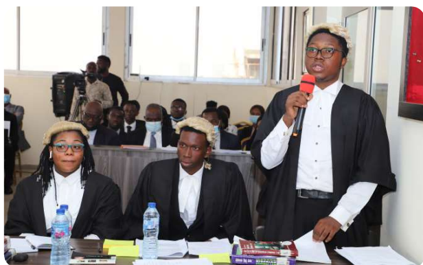
Cross-section of the Students during the Moot Court Trial