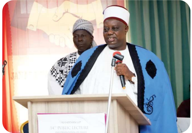
HRH Hon. Justice Sidi Bage, JSC (Rtd.) giving the Chairman's Opening Remarks