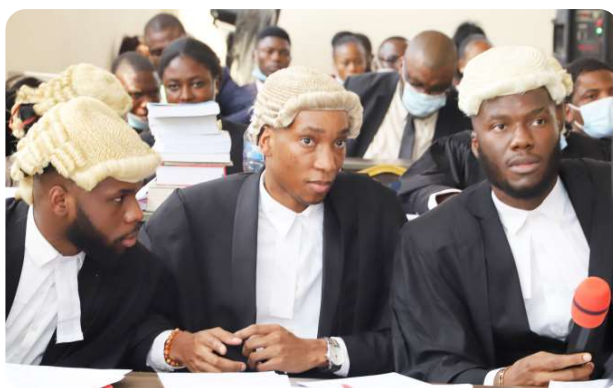
Cross-section of the Students during the Moot Court Trial