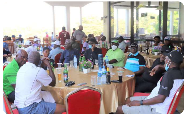
Cross-section of the guests during the prize presentation